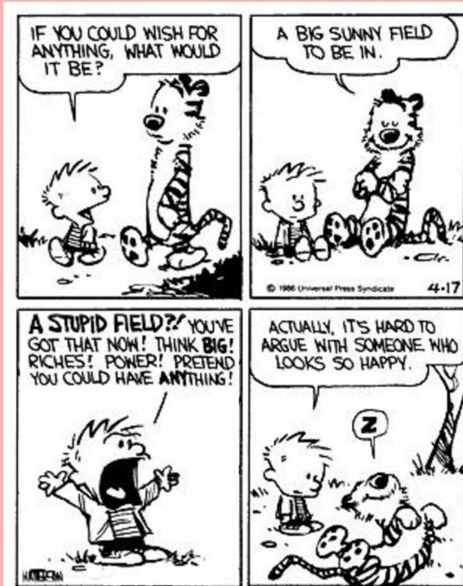
Calvin and Hobbes by Bill Watterson

We sure could do with a little bit of hope!