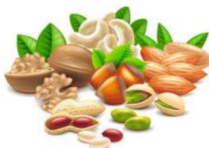
Soaked seeds and nuts