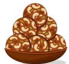
Nut and date ladoos