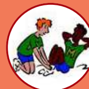
Couples workout programme