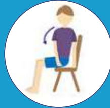
Seated spinal twist hold 10 seconds, repeat twice