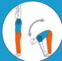
Standing toe touch hold 10 seconds, repeat twice