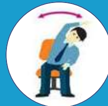
Seated Sideways stretch hold 10 seconds, repeat twice

*Contributed by our in-house Fitness Expert