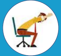
Seated Upper back stretch-hold 10 seconds, repeat twice