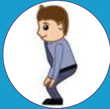
Knee bending exercise - 15 times

Each exercise - 10 times clockwise & 10 times anti clockwise