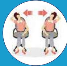
Seated Neck stretch hold 10 seconds, repeat twice