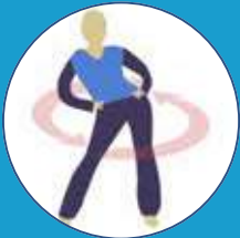
Standing hip rotation

Each exercise - 10 times clockwise & 10 times anti clockwise